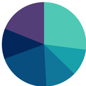
Annual Budget: 765.410 USD