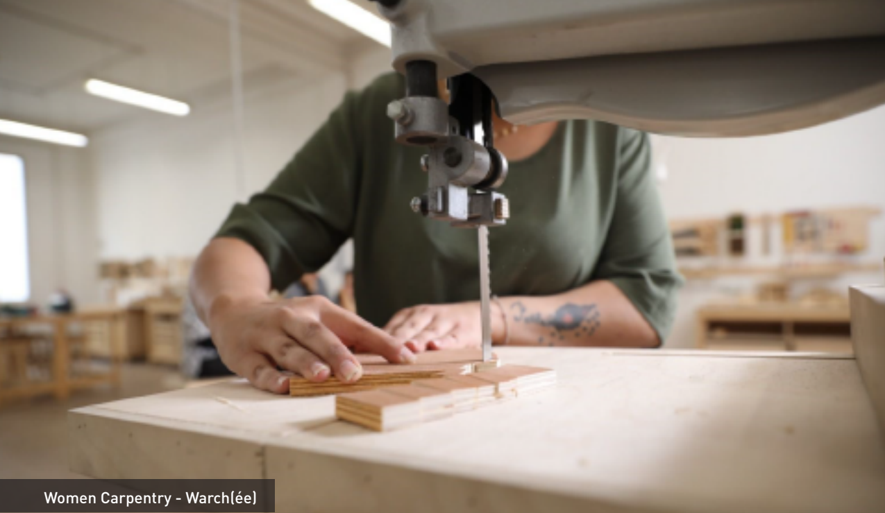
Women Carpentry - Warch(ée)

The Platform is a space that provides diverse supports to civil society and grassroots initiatives. In 2023, various groups were supported with the financial support of CAFOD and the Catholic Committee Against Hunger and for Development (CCFD-Terre Solidaire), and a donation from the Student Union of the University of Helsinki.