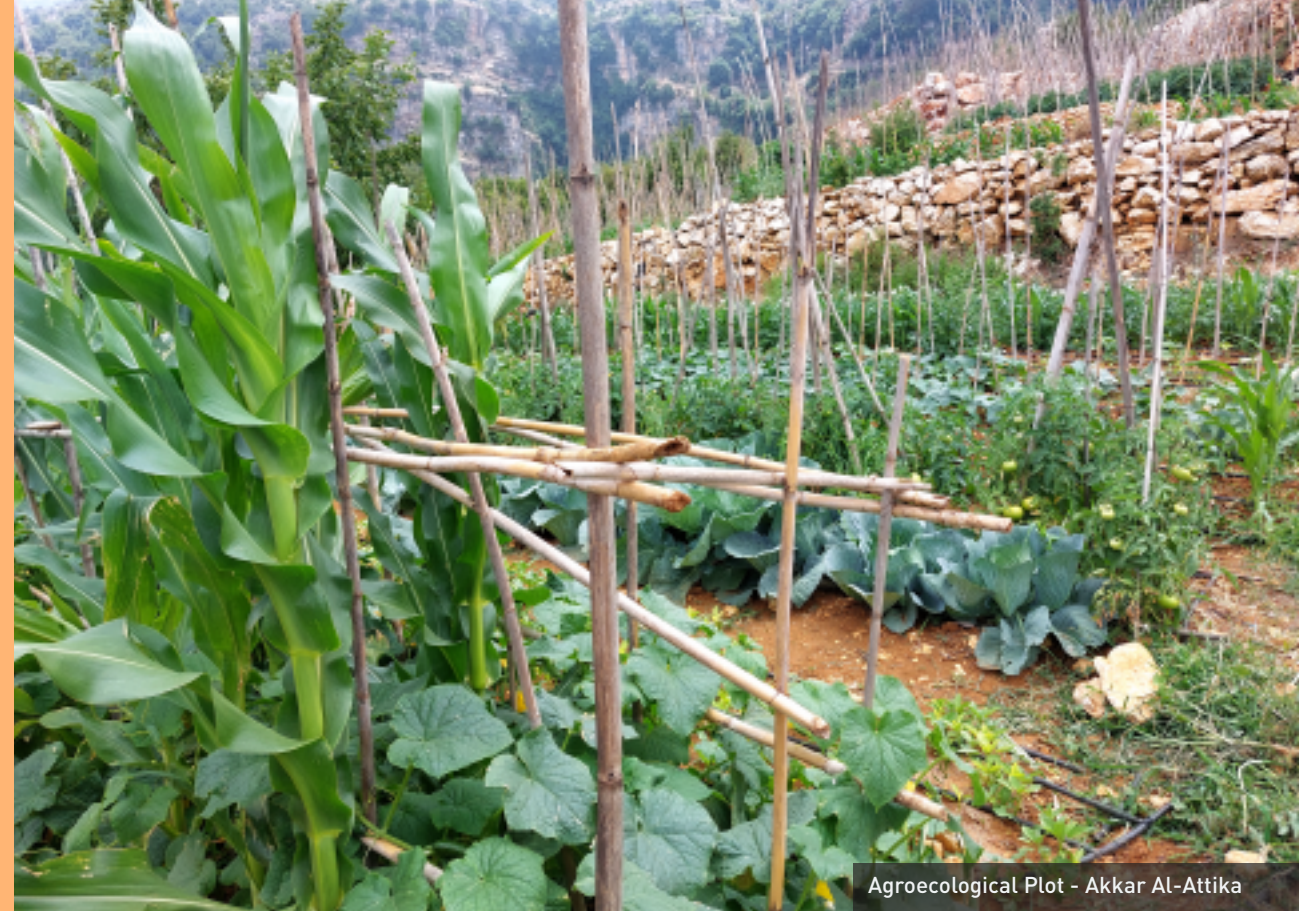
Agroecological Plot - Akkar Al-Attika

Today, Mada continues to act as a local development agency, exploring new approaches and sectors of development in the deteriorating socio-economic context.