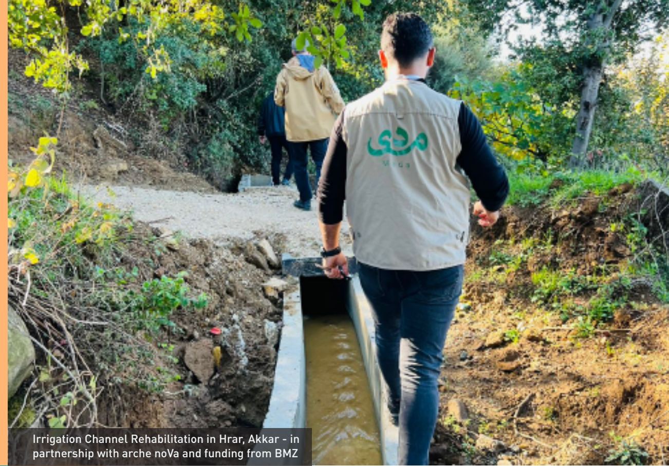
Irrigation Channel Rehabilitation in Hrar, Akkar - in partnership with arche noVa and funding from BMZ

Non-discrimination and equity; Democracy and participation; Commitment to public interest; Respect and protection of the natural environment; Transparency and accountability; Creativity and flexibility; Autonomy and responsibility; Independence from political parties and private interests.