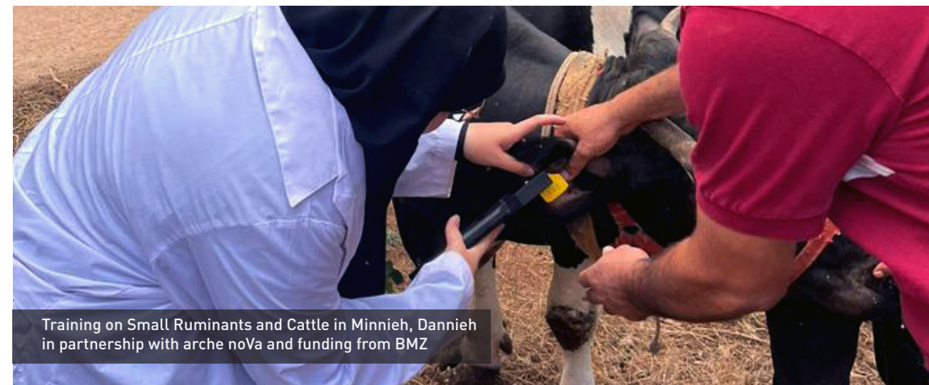
Training on Small Ruminants and Cattle in Minnieh, Dannieh in partnership with arche noVa and funding from BMZ