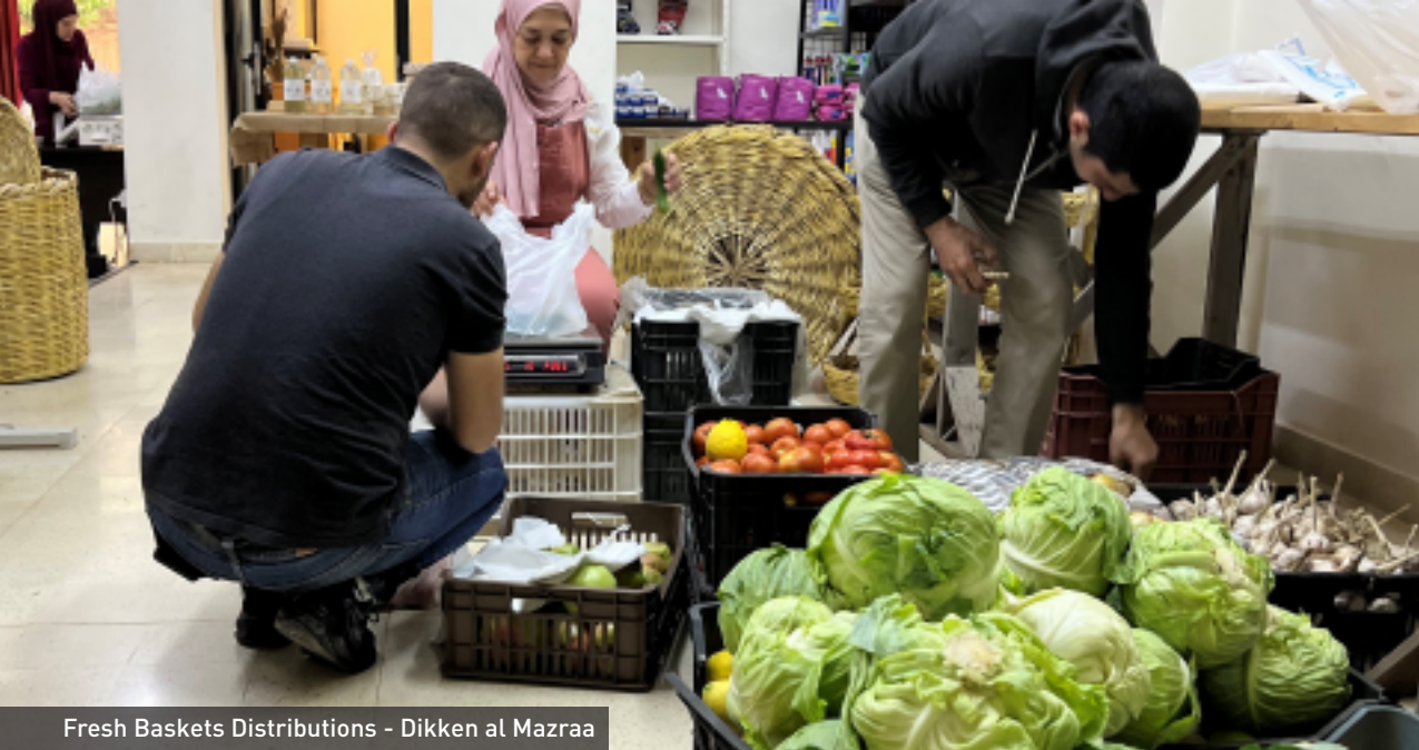
Fresh Baskets Distributions - Dikken al Mazraa

Since 2022, Mada scaled-up linkages between The Platform and its agroecology projects in Akkar through two projects with the objective of contributing to Food Sovereignty in Lebanon: