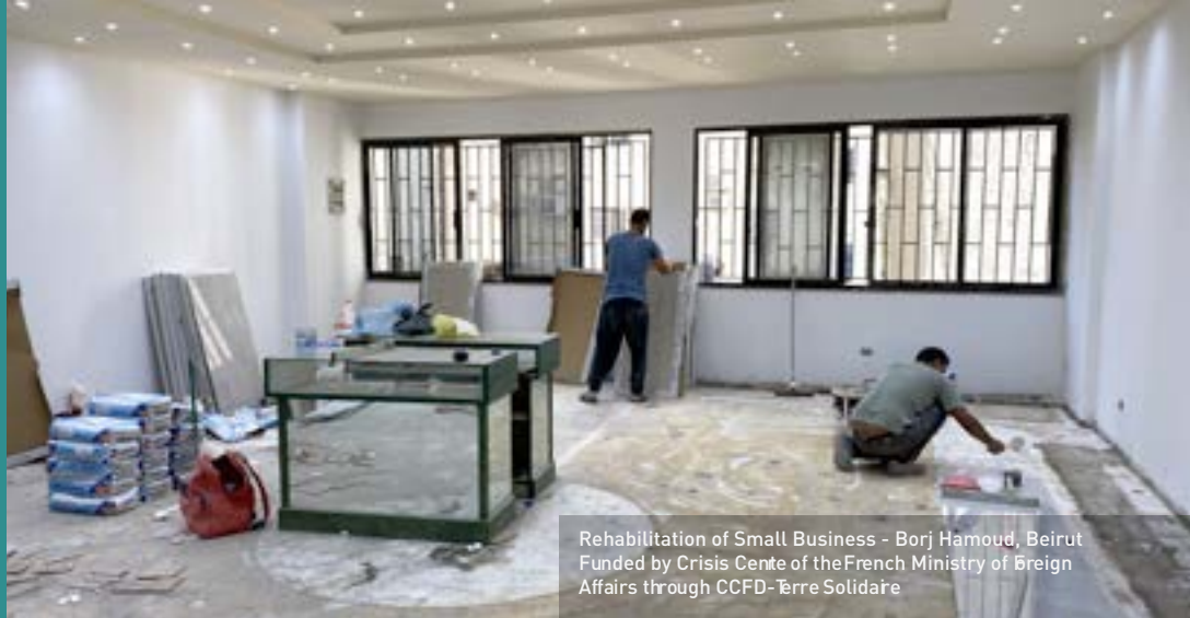
Rehabilitation of Small Business - Borj Hamoud, Beirut Funded by Crisis Centre of the French Ministry of Foreign Affairs through CCFD-Terre Solidaire

Following the Beirut Blast, Mada responded by purchasing fresh produce from small-scale farmers in Akkar and distributing to kitchens and households in the impacted areas. This allowed Mada to develop a presence in Beirut.