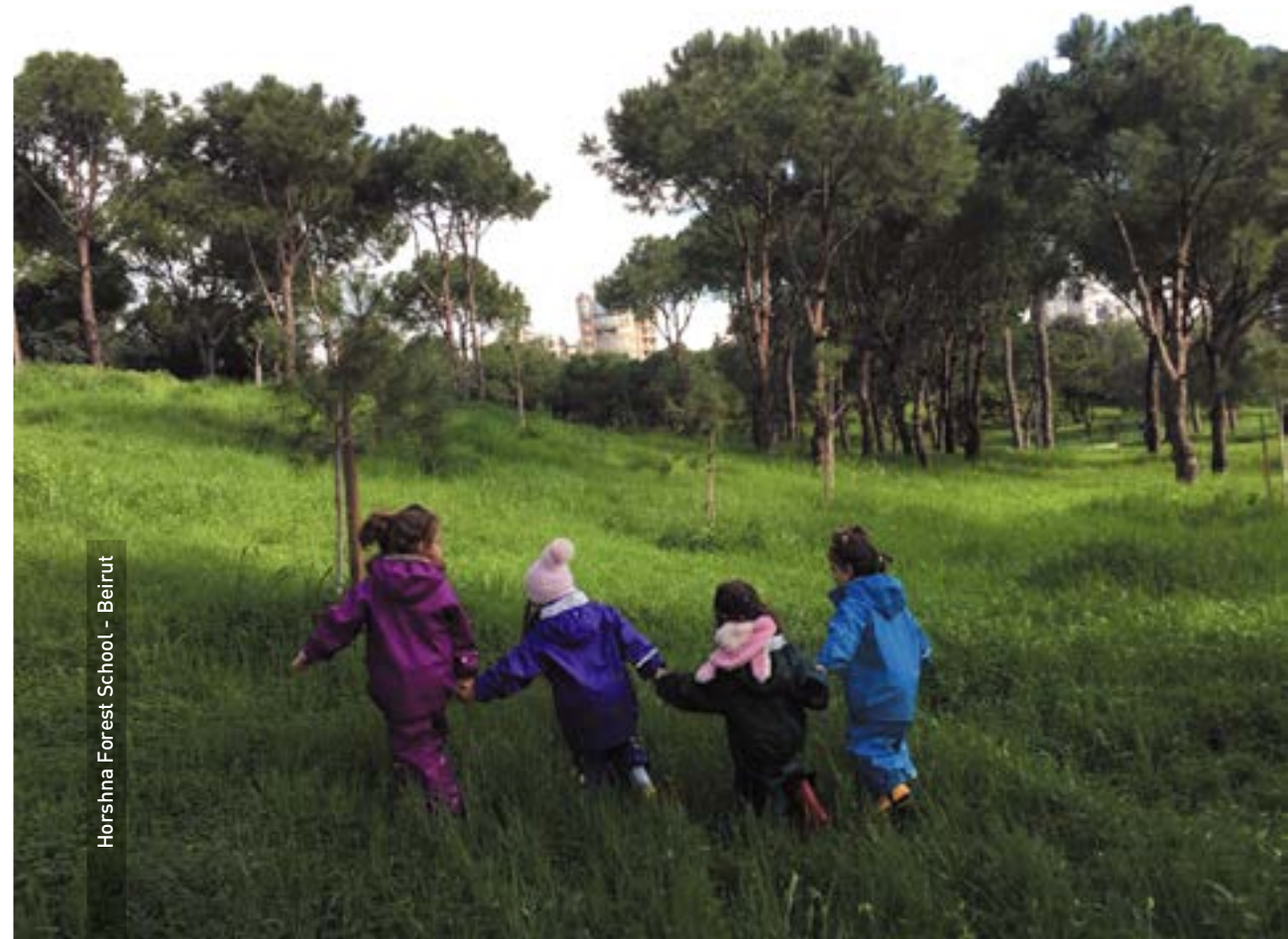
Horshna Forest School - Beirut