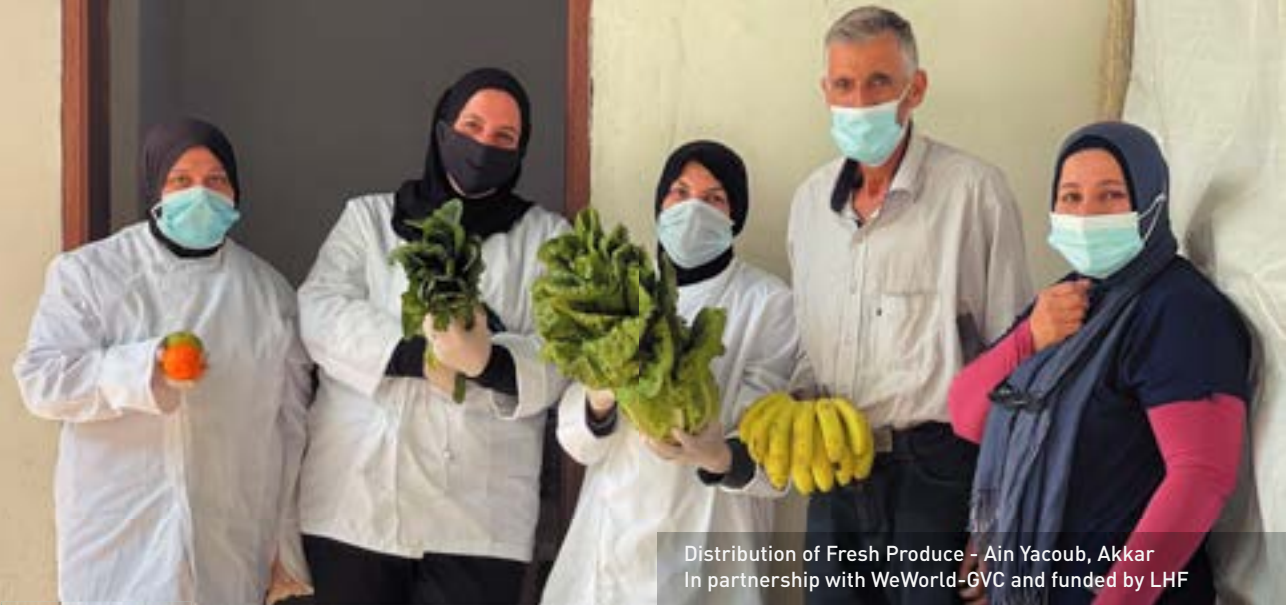
Distribution of Fresh Produce - Ain Yacoub, Akkar In partnership with WeWorld-GVC and funded by LHF