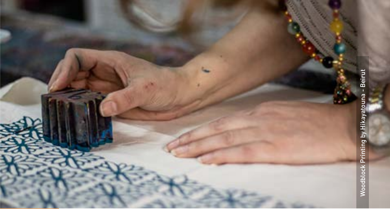
Woodblock Printing by Hikayatouna - Beirut

Mada's Platform, established in 2005, is a space that provides diverse support that takes different forms to creative civil society groups. In 2021, 8 formal and informal groups were supported with funding from the Catholic Agency for Overseas Development (CAFOD) and the Fondation de France.