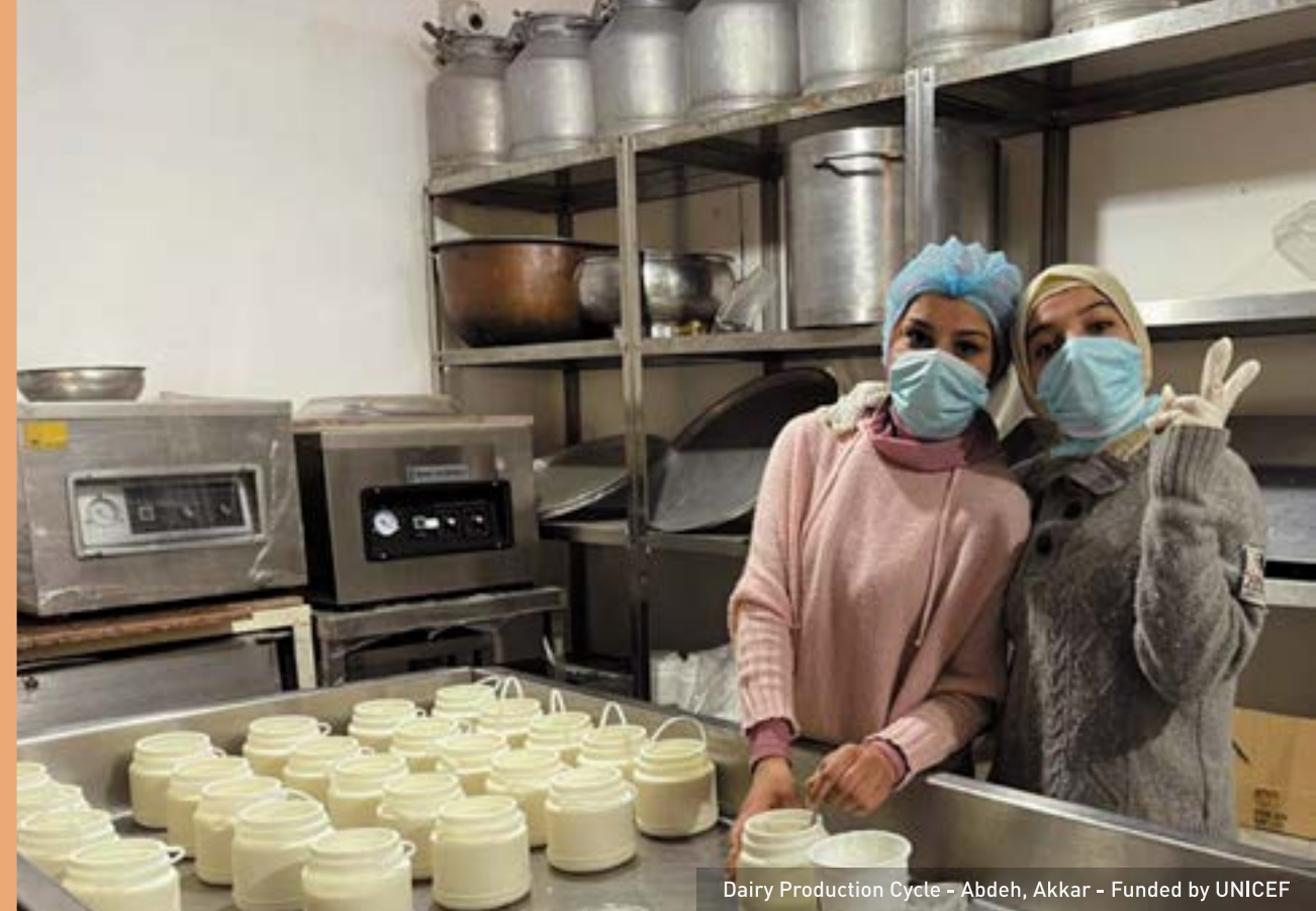
Dairy Production Cycle - Abdeh, Akkar - Funded by UNICEF

Mada strives for the emergence of balanced communities, appreciative of diversity, open to the world, and respectful of human rights and social justice; communities that base their development on a long-term vision of public interest and on models that emphasize a harmonious relationship between human beings and the environment. Members of these communities would be committed, accountable, and creative individuals, able to take initiatives and unite their energies within effective partnerships.