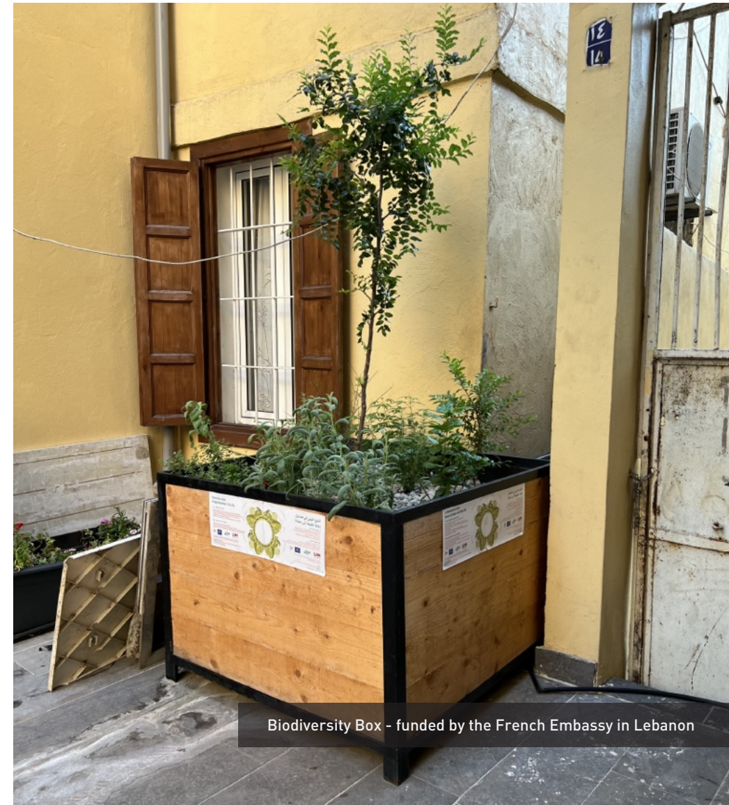
Biodiversity Box - funded by the French Embassy in Lebanon