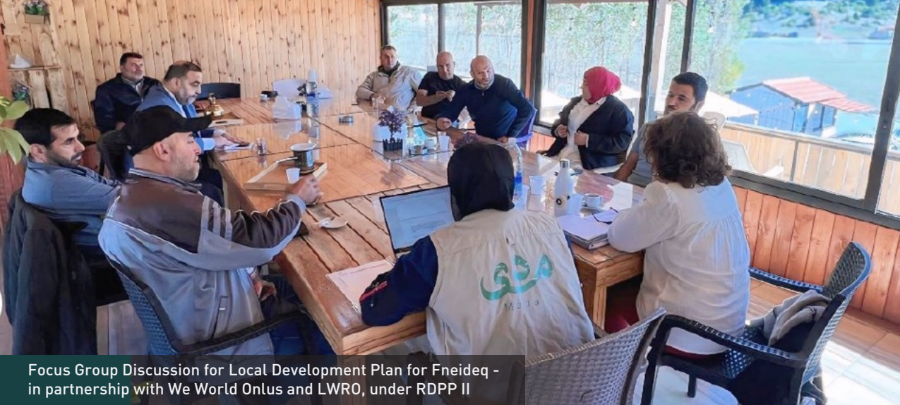
Focus Group Discussion for Local Development Plan for Fneideq - in partnership with We World Onlus and LWRO, under RDPP II