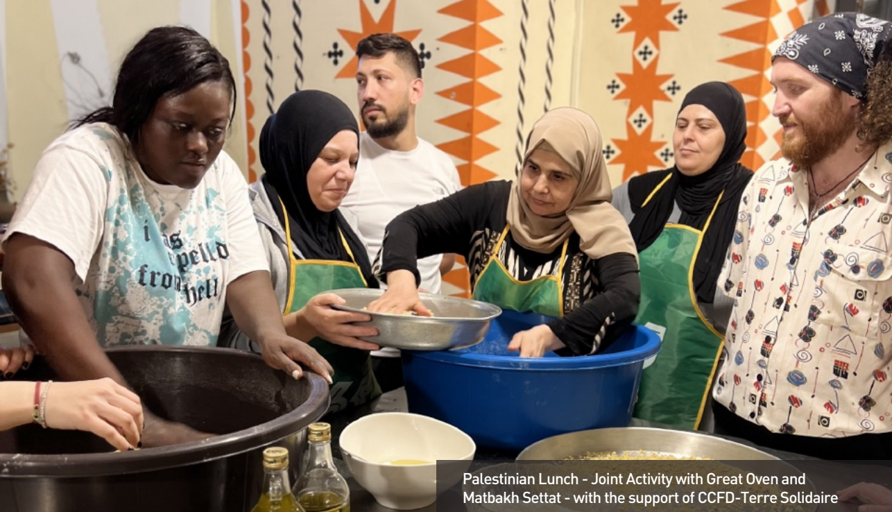
Palestinian Lunch - Joint Activity with Great Oven and Matbakh Settat - with the support of CCFD-Terre Solidaire

The Platform is a space that provides diverse supports to civil society and grassroots initiatives. In 2024, various groups were supported with the financial support of CAFOD and CCFD-Terre Solidaire.