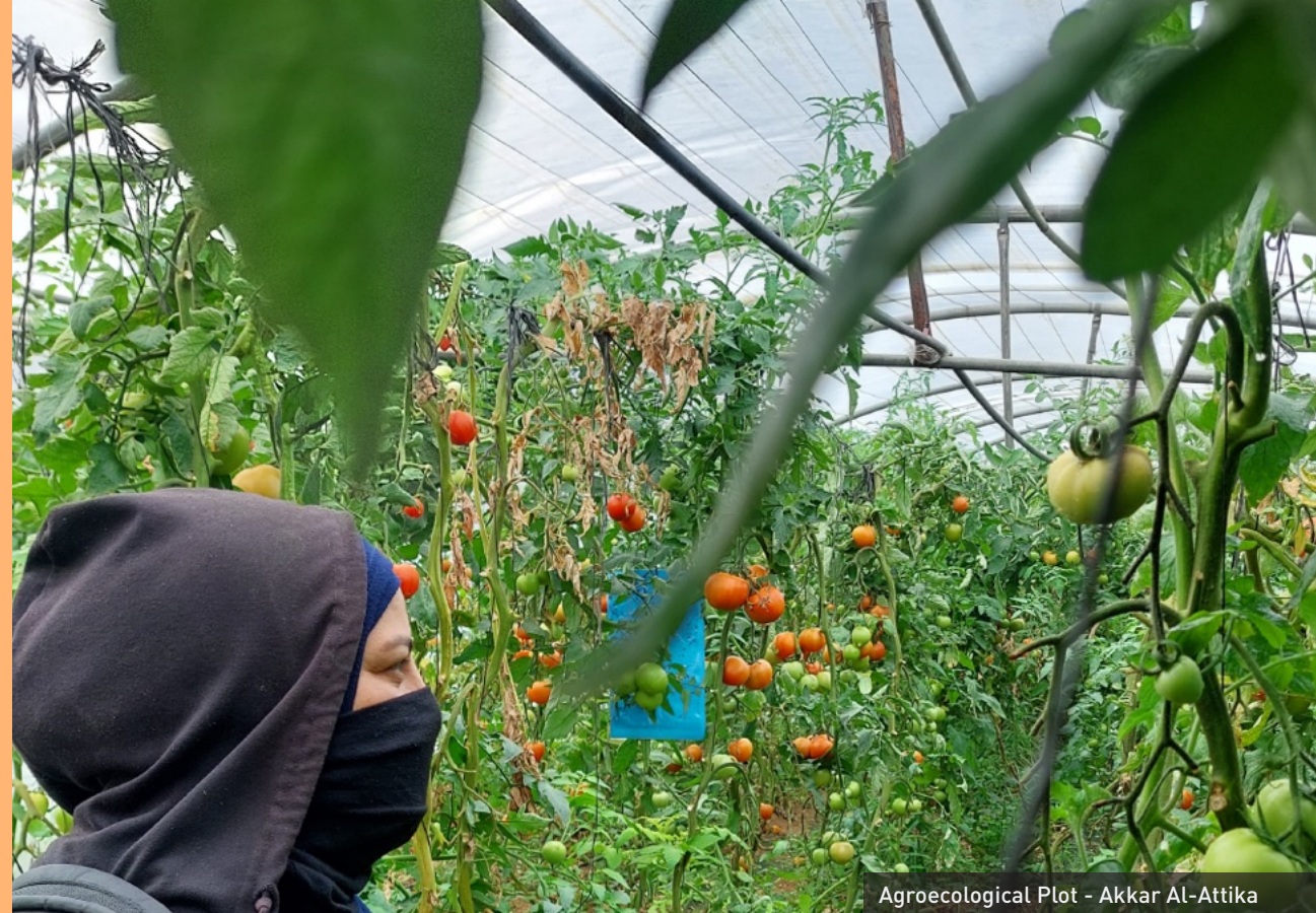
Agroecological Plot - Akkar Al-Attika

Today, Mada continues to act as a local development agency, exploring new approaches and sectors of development in the deteriorating socio-economic context.