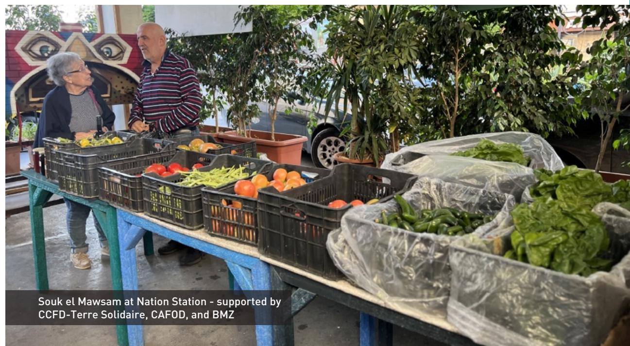
Souk el Mawsam at Nation Station - supported by CCFD-Terre Solidaire, CAFOD, and BMZ