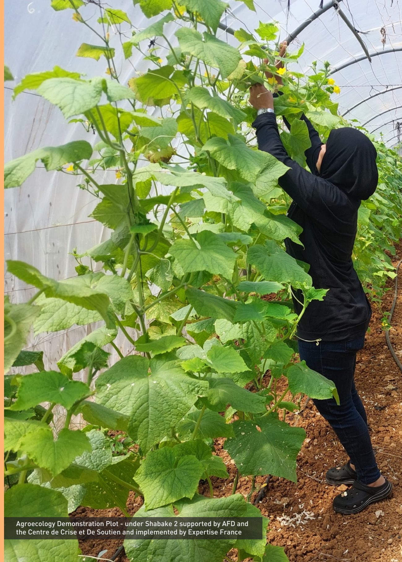
Agroecology Demonstration Plot - under Shabake 2 supported by AFD and the Centre de Crise et De Soutien and implemented by Expertise France