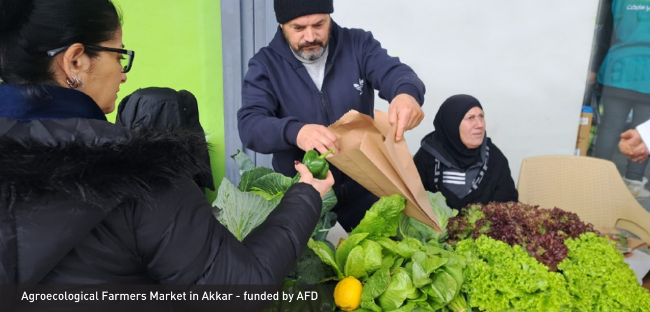
Agroecological Farmers Market in Akkar - funded by AFD