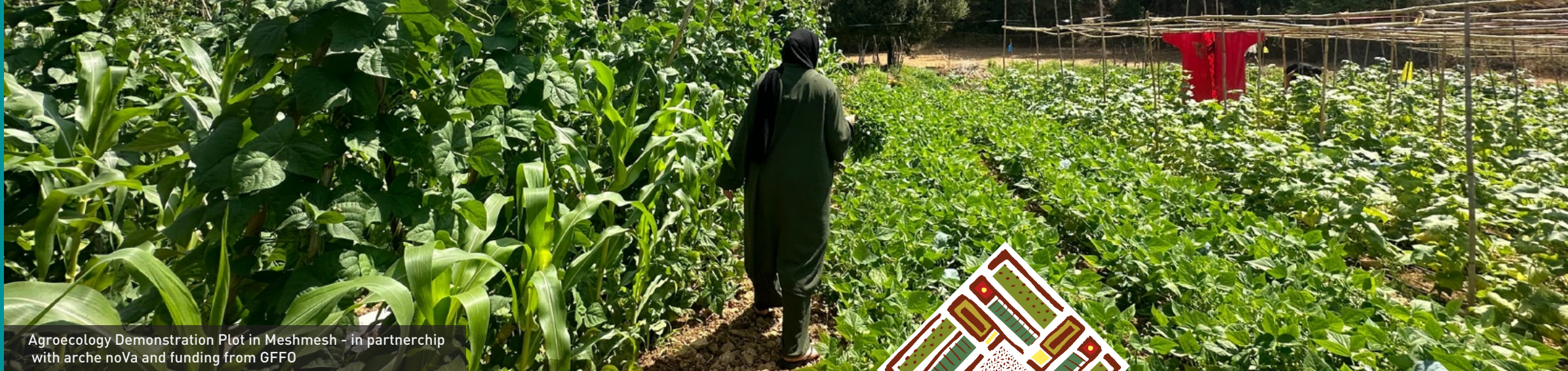
Agroecology Demonstration Plot in Meshmesh - in partnership with arche noVa and funding from GFFO