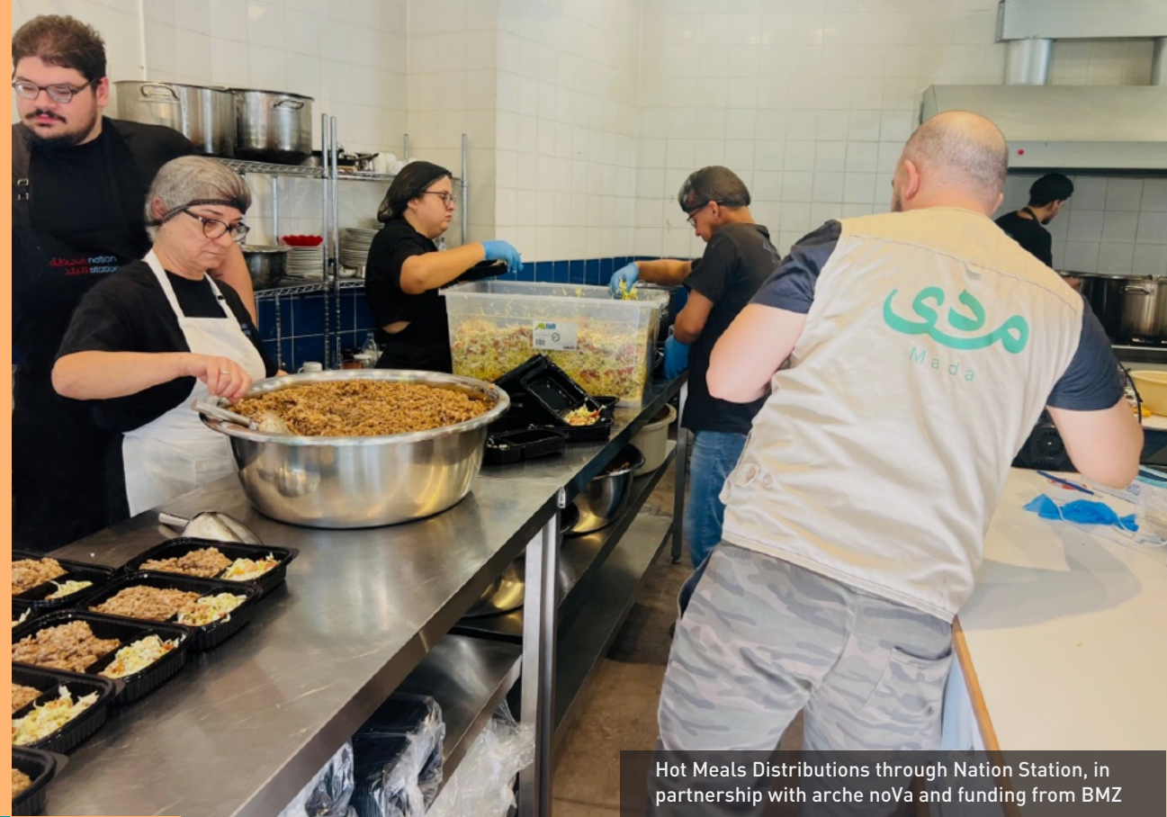
Hot Meals Distributions through Nation Station, in partnership with arche noVa and funding from BMZ

Mada strives for the emergence of balanced communities, appreciative of diversity, open to the world, and respectful of human rights and social justice; communities that base their development on a long-term vision of public interest and on models that emphasize a harmonious relationship between human beings and the environment. Members of these communities would be committed, accountable, and creative individuals, able to take initiatives and unite their energies within effective partnerships.